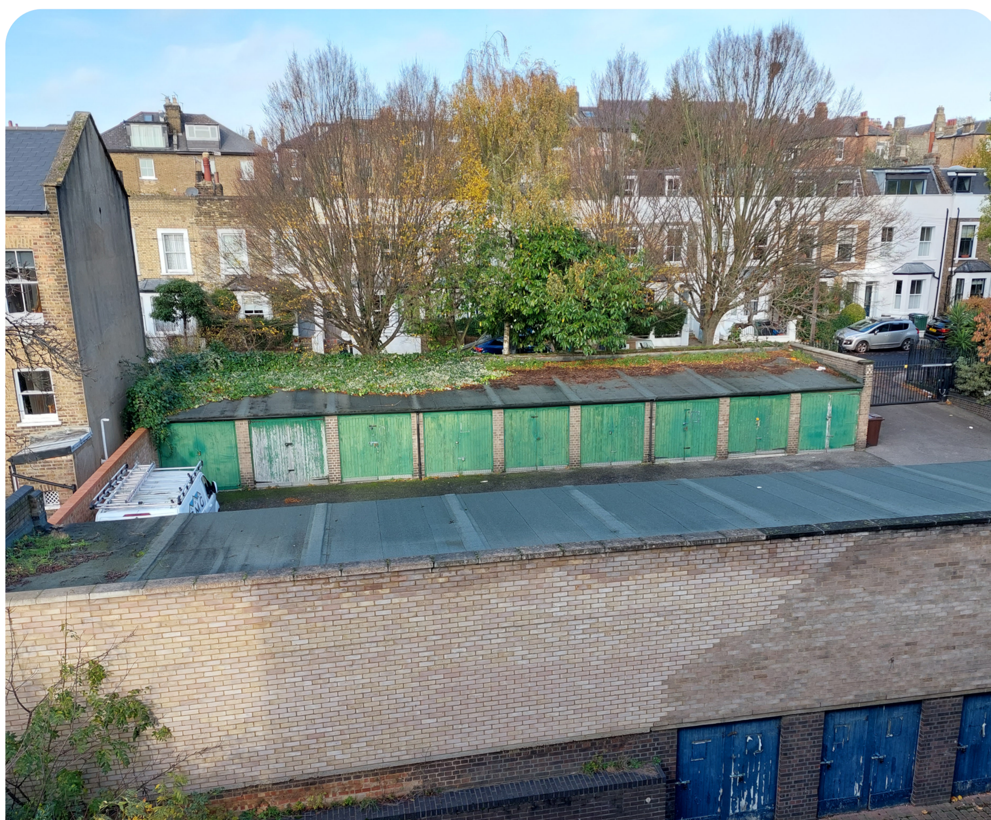
Garages and storeheds